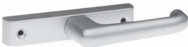
With round grip