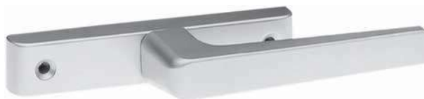
With straight grip